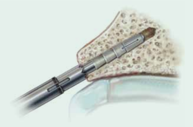
NanoTack is the smallest footprint hip implant that minimizes defects to the labrum.